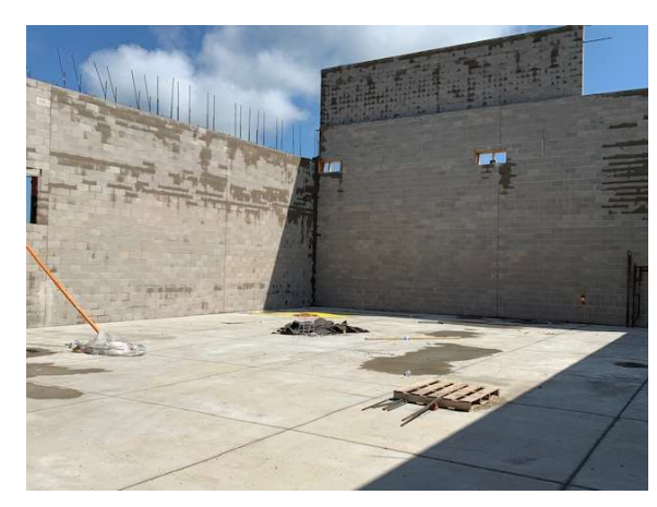
TOTAL PROJECTED CONSTRUCTION COST = $30,000,000