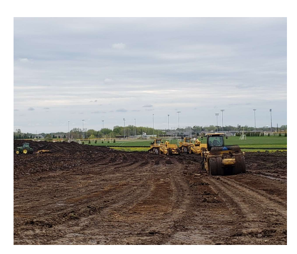
TOTAL PROJECTED CONSTRUCTION COST = $29,000,000