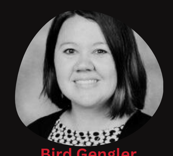
Oak Ridge Middle School