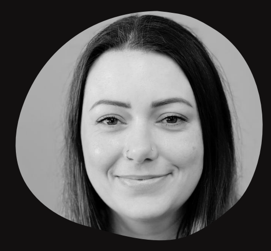
Kaleigh Morrow Wilkins Elementary