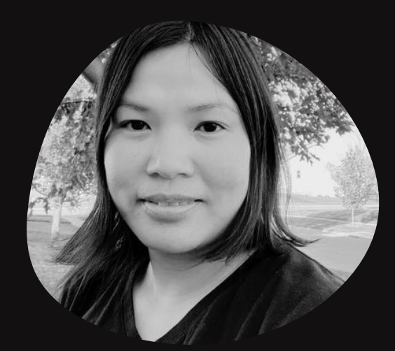
Au Vu Wilkins Elementary