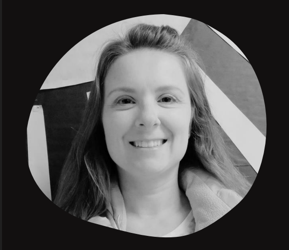
Tara Wagner Novak Elementary School